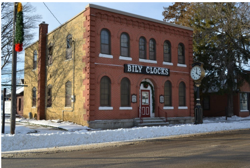
Antonin Dvorak and his family resided in the above building, now a clock museum, in Spillville, Iowa during the summer of 1893.